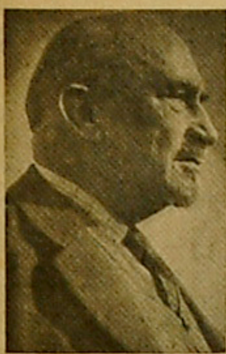
CH. WEIZMANN President