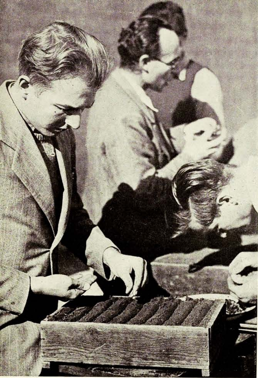
(Above) The scientific approach makes the soil yield its fruit. (Below) Young refugees from Poland on their arrival in the homeland.