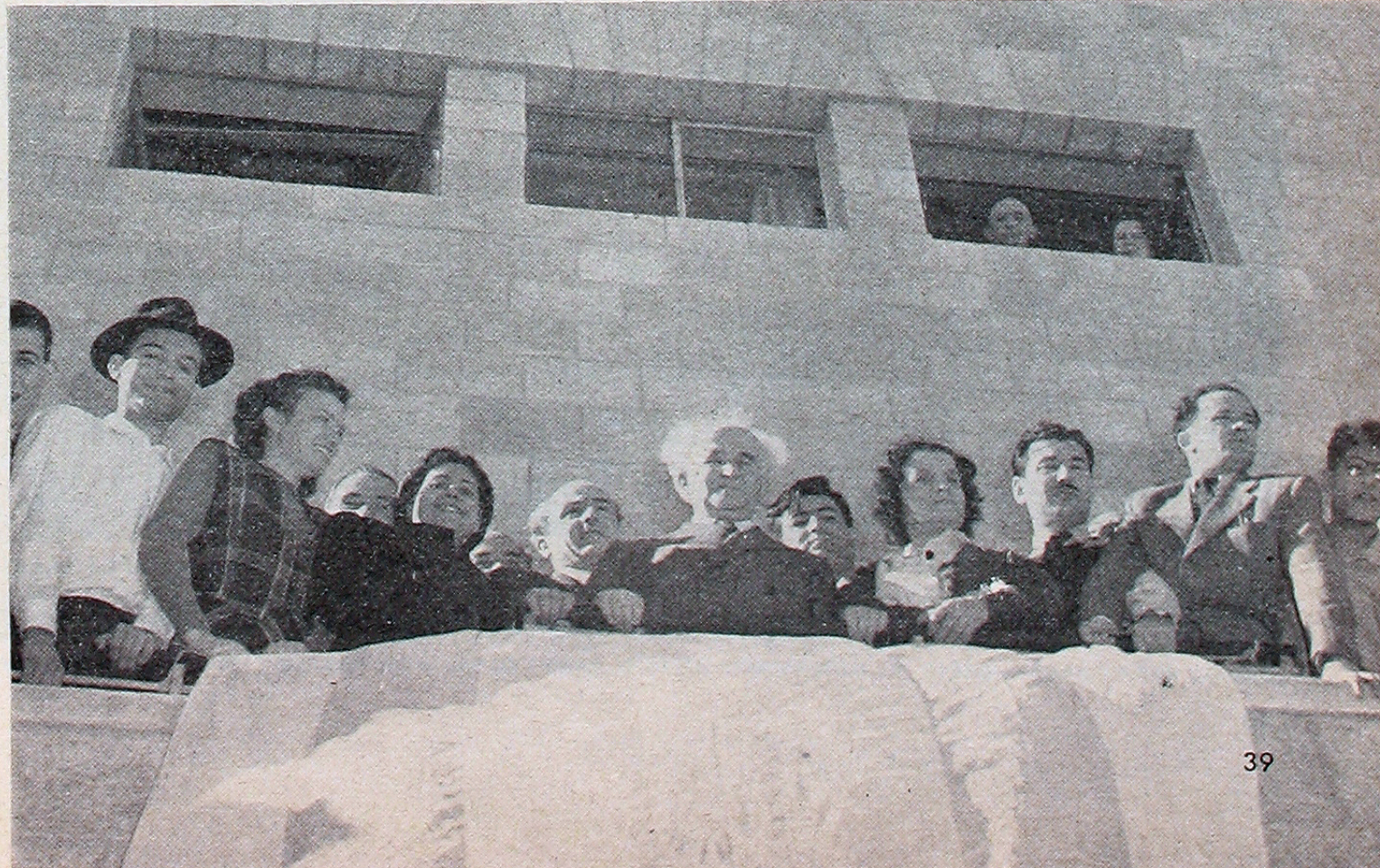
cheer white-haired David Ben-Gurion ( in center, below ), who will in all probability become the first premier of the new Jewish state when the U.N. plan becomes effective.