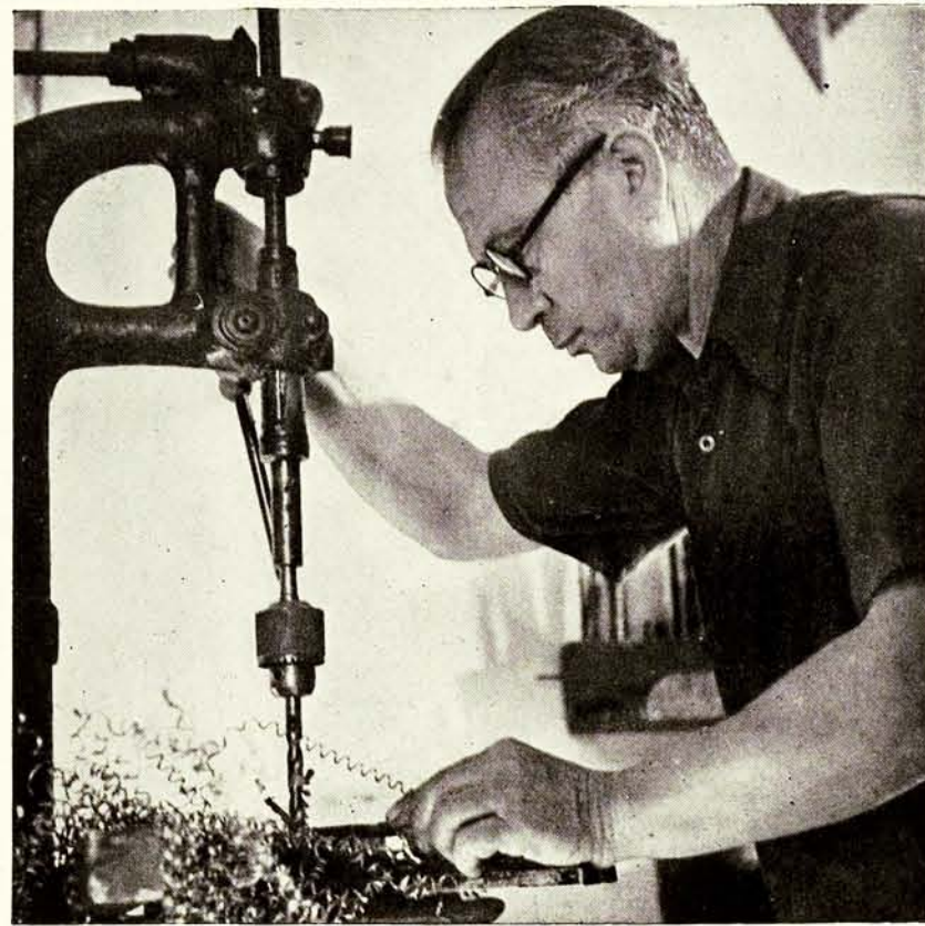
A refugee on the Palestine war production line.

T HE last quarter of a century will live in history as a strange interlude in which delay in the reaffirmation of the principles of human freedom brought us to the brink of destruction and embroiled mankind in the bloodiest war in the history of civilization. During that strange interlude appeasement or the escape formula of statemanship appeared as the