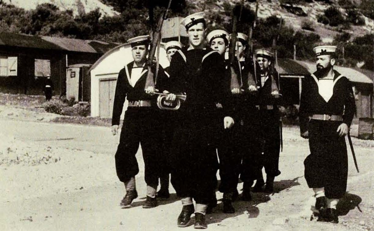
A few of the boys in a Palestine training camp carrying out their daily drill to develop proficiency in the art of handling and using rifles, which is an important part of naval training. The bugler leads the march with petty officer at right calling commands.