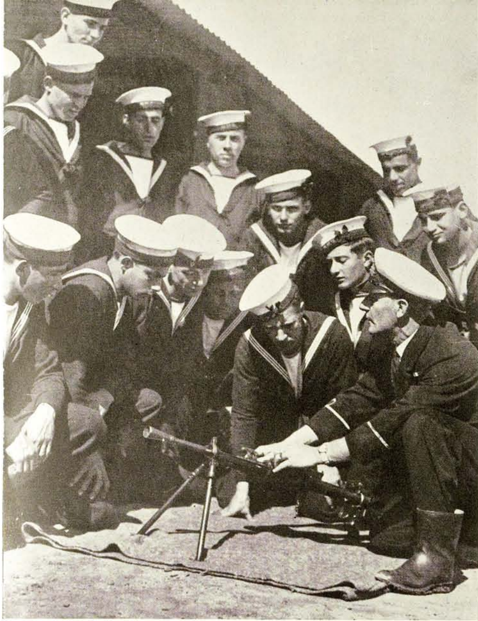
(Above) An officer shows some of the lads how to set up a gun and get it into operation without delay. (Below) Parading under the age-old olive trees of Palestine. Note the camouflaged buildings in background.