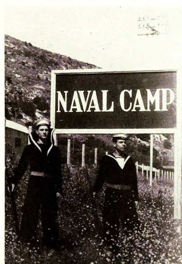
Two naval recruits standing guard at the entrance to the training camp.

H AVING proved their courage on the fighting fronts with ground and air units of the British Army, the young Jews of Palestine are now in increasing numbers enlisting for service in the Royal Navy. More than a thousand graduates of the Haifa Nautical School and other maritime schools established by the Jewish Maritime League with the help of the Jewish Agency for Palestine have already enrolled, a number of them as commissioned and petty officers. The photos on this page were taken at the Palestine Training Camp, where future sailors are given military training. Here they are taught discipline and the use of arms, and initiated generally into Navy life. Many of the boys who have answered the call of the sea are making a valuable contribution to victory through their service in coast patrols, ship repair works and other branches of the Navy. In Palestine, Jewish enrollment in the Navy, as in the Army, is entirely on a voluntary basis.