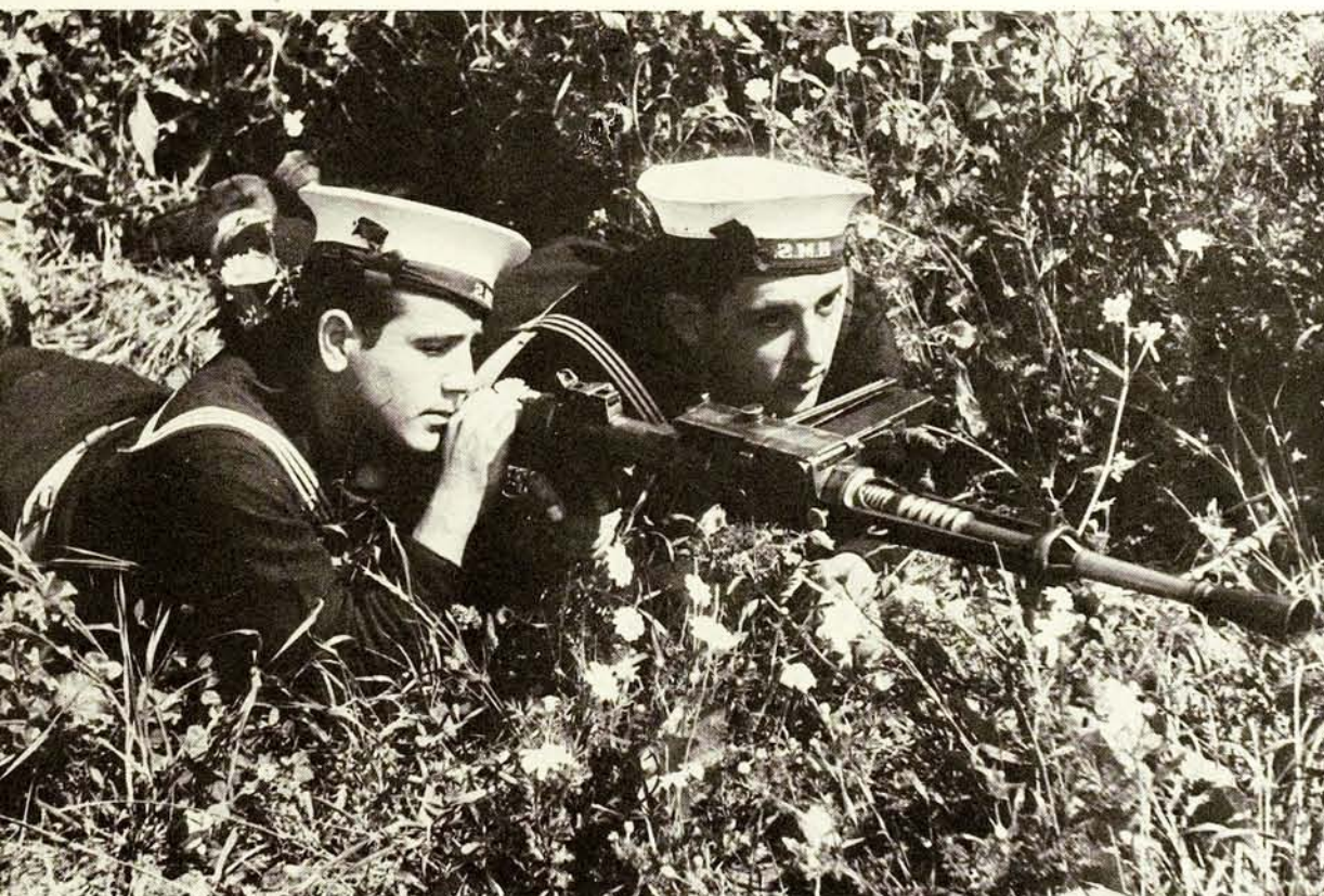
(Above) Two recruits concentrate on their machine-gun technique. (Below) In modern warfare, loading and unloading supplies are as vital as the correct use of military armament. That is why these Jewish sailors-in-training apply themselves diligently to the task.