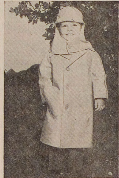
The Roos Storm Coat is completely waterproof. Made of bright yellow rubber fabric, it has a matching storm hood. Gives protection in the hardest down-pour. Sizes 8-12. Coat and hood priced as set at $5.50

Who worries about the weather? Not these young men! They're ready for cold, or fog, or rain in Roos winter weather topcoats and raincoats.