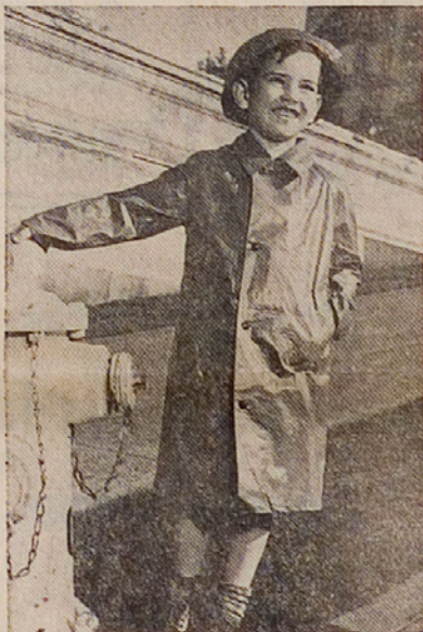
Koroseal, the miracle fabric makes this lightweight, pliable raincoat. 100% waterproof, it sheds water like a duck. Rolls up into a small package when not in use. Comes with matching hat. Sizes 8 to 12. Set, $5.95