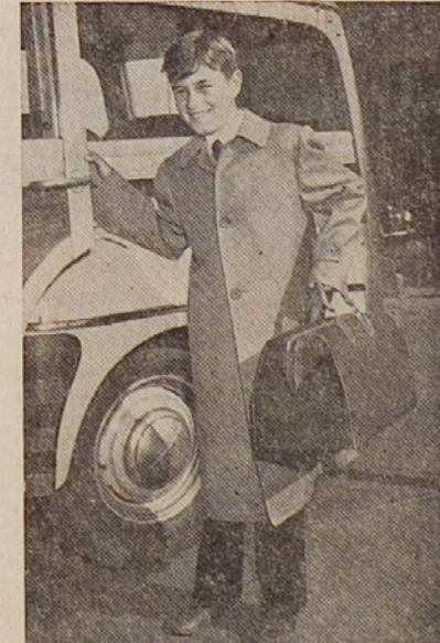
This Gabardine Topcoat has received 100% approval from our young men of distinction. Expertly tailored of pure virgin wool. All-weather collar and big slash pockets. Full cut, very comfortable. Sizes 15-22, $45