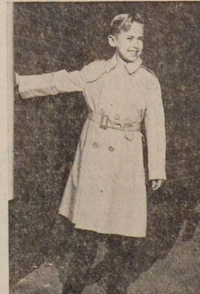
The Roos Trench Coat, modeled after an officer's coat is Zelan-treated to keep out rain. Natural tan cotton gabardine with plaid cotton flannel lining. Storm tabs on sleeves. Snug-fitting all-weather collar. 10-18, $16.50