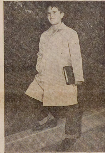
Most young men like this collegiate styled Station Wagon Coat for school and sports wear. Sturdy cotton gabardine. Zelan-treated to make it rain repellent. Red wool flannel lining for warmth. 10-20, $9.95