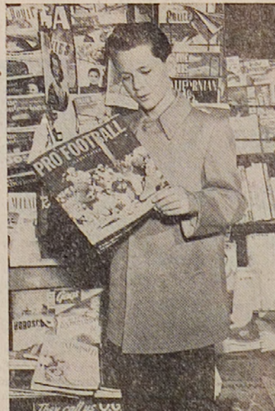
Another school favorite is this short-length reversible topcoat. Pure wool cavalry twill on one side . . . it reverses to a cotton gabardine, Zelan-treated weather coat. Sizes are 15 to 22 and the price is only $22.50