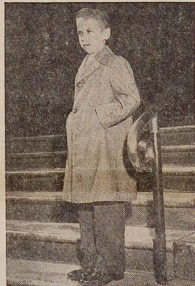
Tailored just like Dads, this tweed topcoat is made of pure virgin wool. Full cut, right for year-round California weather. Herringbone or heather tweed mixtures: blues, browns, greys. 3-12, $20.00 and $25.00