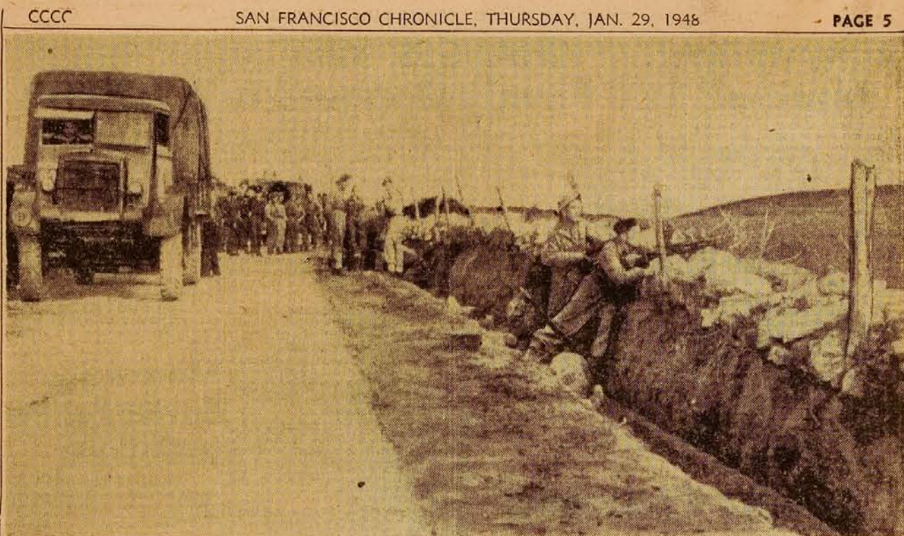
DEFENSE AGAINST ARABS —Motorized British soldiers of the Middlesex regiment and Palestine police move carefully up the road toward Yehiam, Palestine, on January 20 to help a Jewish settlement under attack by 500 Arabs. The attackers directed mortar and automatic weapon fire against a settlement built amid ruins of a castle remaining from the Crusaders. The community is one of 19 outside boundaries of the proposed Jewish state.

BAGHDAD, Iraq, Jan. 28 (AP)—The people of Baghdad paid public tribute today to those killed while protesting the proposed British-Iraqi treaty of alliance. Premier Salih Bey El Jaburi's cabinet resigned last night and thus collapsed the Premier's fight for ratification of the treaty. The pact was signed in Britain about two weeks ago. More than 300,000 persons marched in a six-mile procession today. Political party and religious leaders, former ministers, members of Parliament and other notables took part. Hospitals reported yesterday that 70 persons had been killed and more than 300 wounded during the previous 24 hours. Coffins of the victims were covered with huge Iraqi flags, with large letters written in their blood on the caskets. A secret police source said Jabr had fled to Hilla, about 75 miles south of Baghdad, to seek protection from the tribes of his father-in-law. (United Press said Jabur flew to Amman. He had been reported seeking refuge at one of the British air bases there.) Attempts continued to form a new cabinet. In Cairo, an Arab League press official told newsmen the Iraqi riots "should induce Britain to chart a policy serving the peoples' interests."