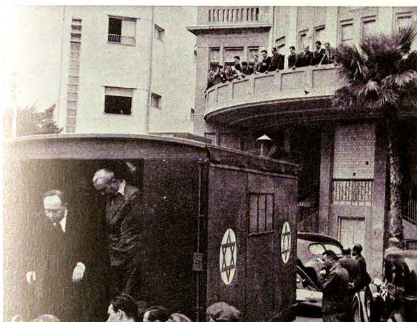
Mayor Rokach emerges from an ambulance which he inspected during a ceremony at the Town Hall of Tel Aviv. A number of ambulances and other medical supplies were contributed to aid Russia.