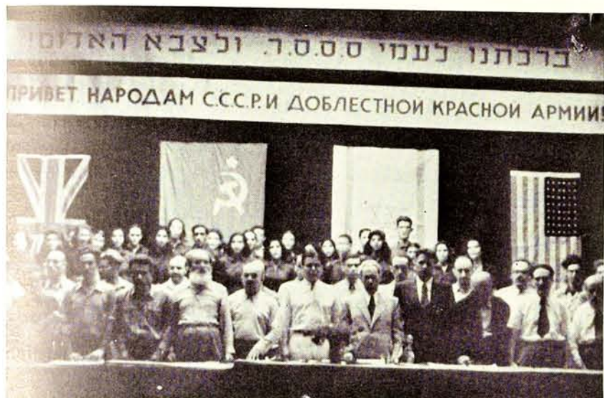
The Star of David hangs with the Hammer and Sickle, the Union Jack and Stars and Stripes at a meeting in tribute to the victorious Russian armies.