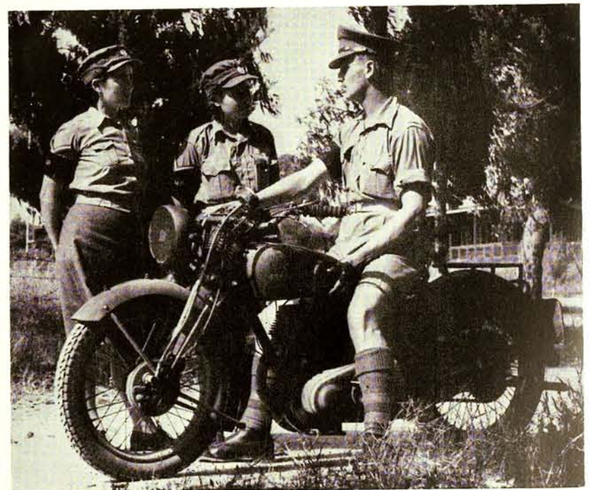
Jewish women in the "Pats" (Palestine Auxiliary Territorial Service) at a training center.

"We must believe, we must relieve The ones who bear the scars, So fight the fight, tonight's the night, The mighty Night of Stars!"