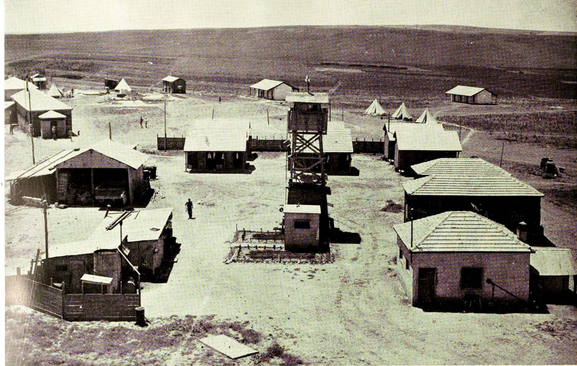
The Jewish settlement of Negba in the South at the age of one.