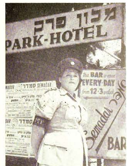
A "Pat" on M.P. duty in Tel Aviv.

For internal security, a particularly important aspect of Palestine's affairs under existing conditions, the sum of $1,155,704 was spent. Included in this sum is provision for recruitment, assistance to the armed forces and their