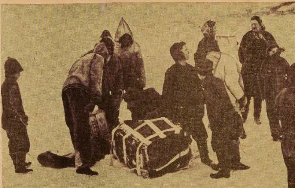
Some of the 136 inhabitants of the fishing settlement of Makkovic gather around the supplies dropped to them in an emergency flight by American and Canadian planes after the villagers' winter supplies had been destroyed by fire.

arrested at Gorakhpur. A dispatch from Kerala said the Mahasabha branch there had been dissolved. Fires were set in Baroda Ahmedabad was placed under curfew, and in Lucknow the police said that persons who distributed sweets to "rejoice" over the Mahatma's death have been arrested.