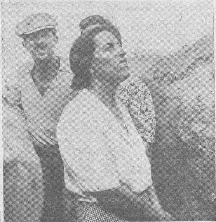
The refugees had occasion to use the trenches when Arab planes flew over. Agrobank has been nicknamed "Camp Bernadotte," because it was an internment center during the first Palestine truce