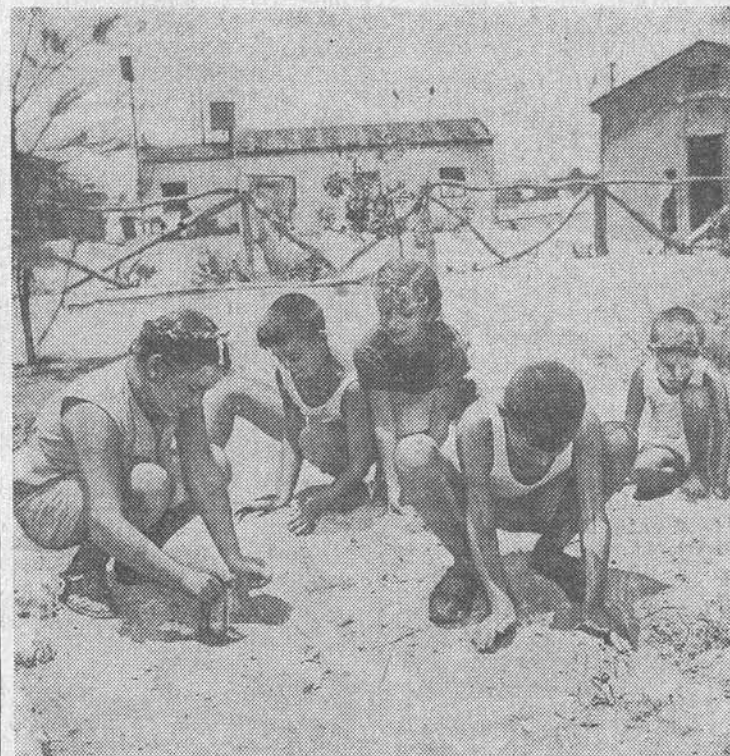
Despite the horrors of war, children will always find time to play. These youngsters at Camp Agrobank and their parents are being resettled in various parts of Israel