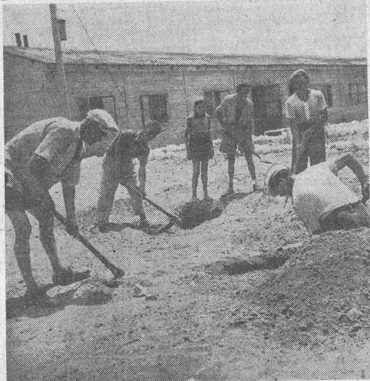
Refugees newly arrived in Palestine from British internment camps in Cyprus found one of their first jobs was a familiar one—digging slit trenches as an air-raid precaution