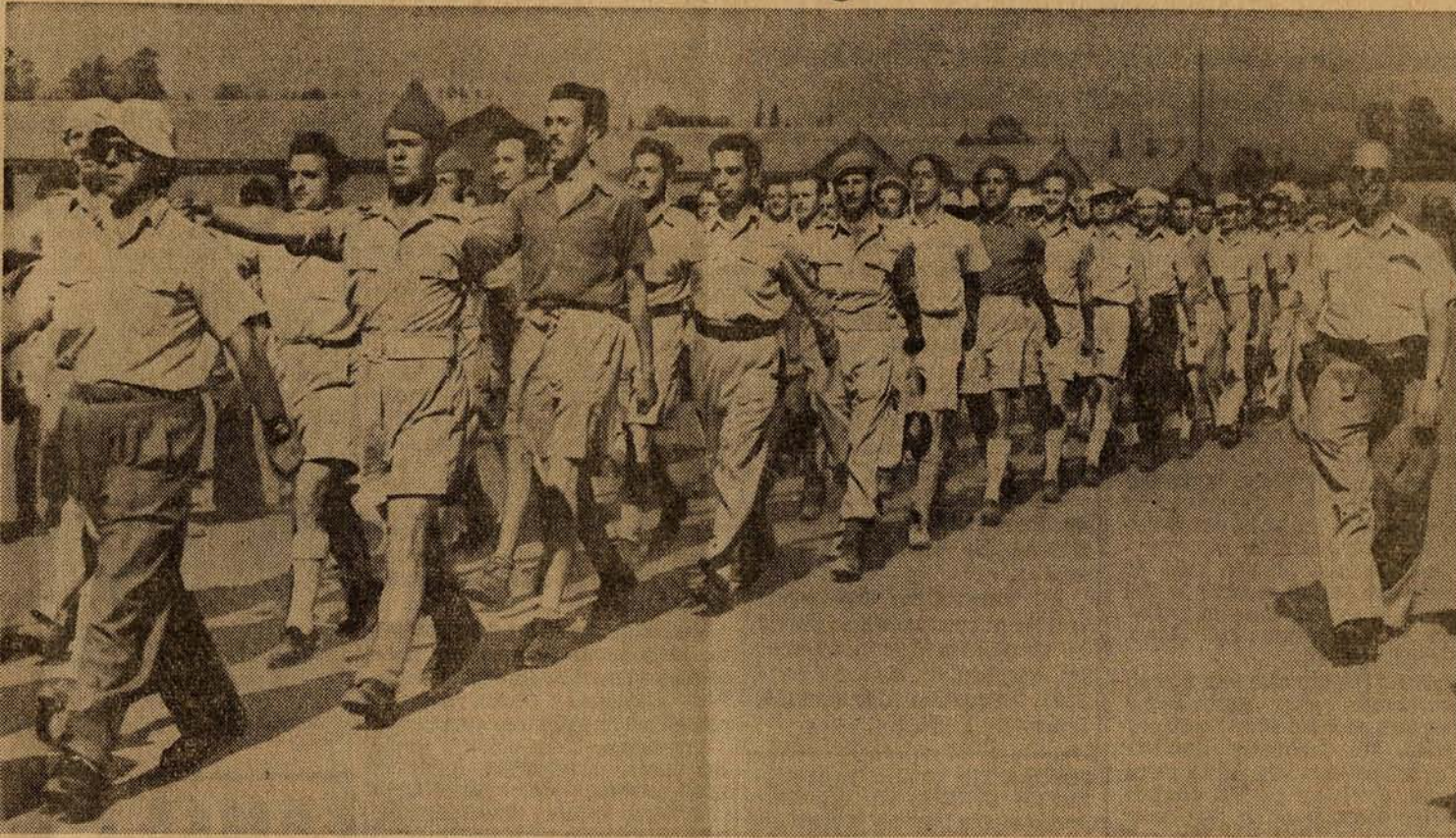
Recruits, drafted by Israel, drilling at reception center near Tel Aviv. Men between eighteen and thirty-six are being conscripted