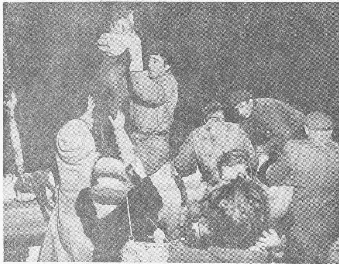
The Italian captain of the two-masted schooner lifting an infant over the side of the vessel as Jews already on ship stand by ready to help their fellow refugees aboard