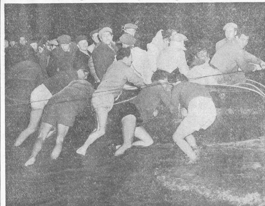
Jews bound for Palestine on the refugee ship Al Tafchiduni (You Can't Frighten Us) leaving a beach near Rome on Dec. 11 in American Army surplus rubber raft. Members of Haganah, the Hebrew defense organization, are pushing the raft off the beach