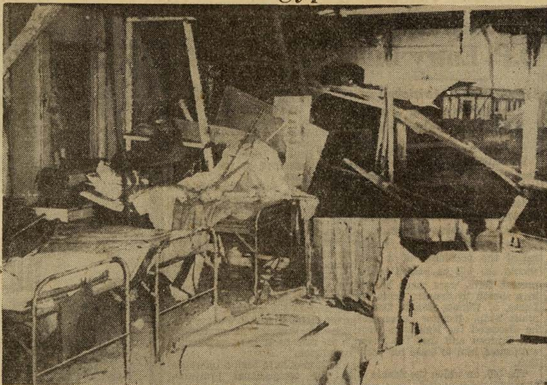
A wall knocked out and debris scattered over beds in a hospital in Tel Aviv Monday after the building was bombed and strafed by fighter planes of the Egyptian Air Force