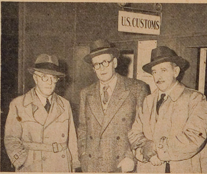
Halvard Lange (center), Norwegian Minister of Foreign Affairs, as he arrived here yesterday aboard a Scandinavian Airlines plane to attend the concluding sessions of the United Nations General Assembly. He was met at La Guardia Field by Finn Moe (left), Norwegian U. N. delegate, and Erling Bent, Norwegian consul general in New York. He had returned to Oslo for a visit last month.

We do not think that the Korean people deserve that fate." A Russian demand that all American and Soviet troops be withdrawn from Korea by early 1948 is scheduled for a vote in the committee tomorrow. The United States has proposed that occupation troops be withdrawn not less than ninety days after an independent all-Korea government has been set up by U. N.-run elections.