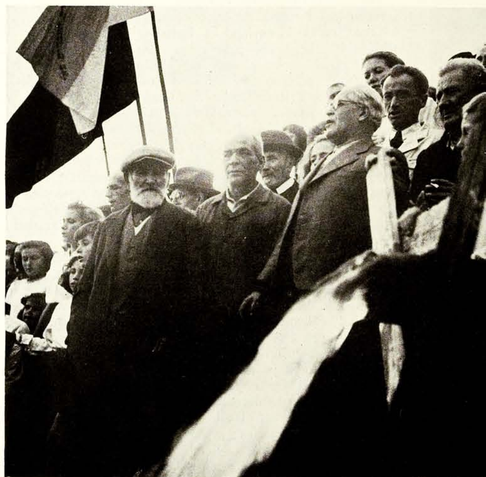
The pioneers of Ginagar stand by as the water gushes from the well.