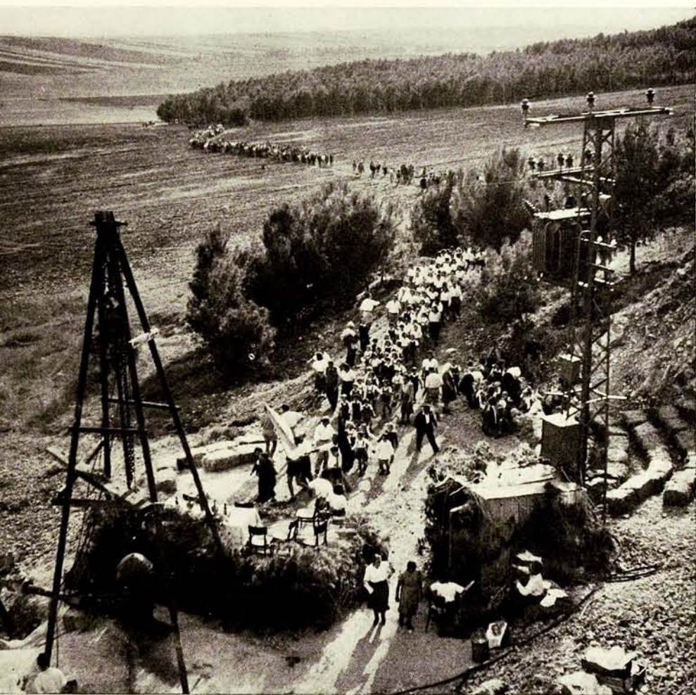
Visitors streaming into Ginegar to celebrate the striking of a new well.

The settlement of Ginegar in the Valley of Jezreel symbolizes the miracle of the rebuilding of Palestine. Twenty years of the toil and sacrifice of the Jewish pioneers have gone into the building of this thriving settlement on land once arid and pestilential. As the sun rises over Ginegar the settlers prepare to join in a celebration marking the completion of a new well. What was accomplished in Ginegar is