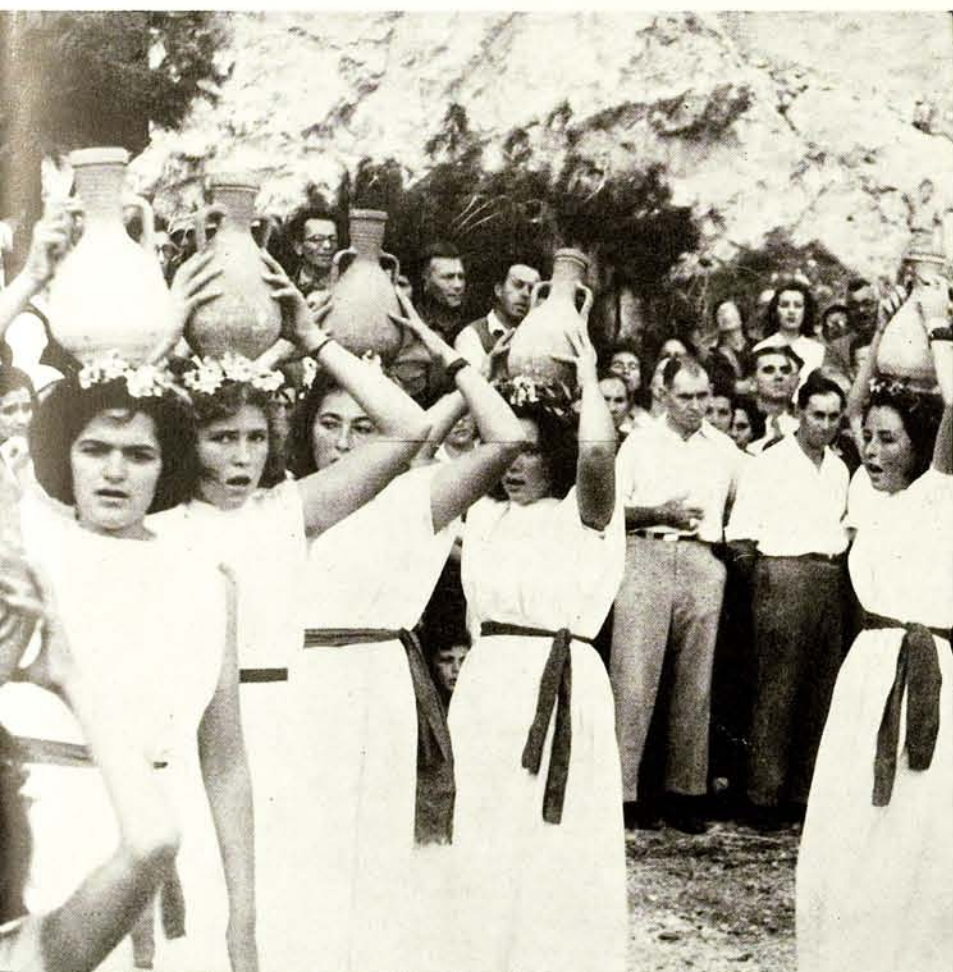
The Water Dance, celebrating the 20th anniversary of the settlement.

the story of what has been accomplished throughout Palestine for it was transformed from wasteland with the help of United Palestine Appeal funds by the Keren Hayesod and the Keren Kayemeth. Ginagar is most famous as the site of the Balfour Forest which, with subsidiary woods, comprises 400,000 Jewish National Fund trees. With the aid of the U.P.A., Palestine is building more Ginagars, purchasing the land, reclaiming the soil, erecting homes and schools, so that tens of thousands of Jews may find security and peace in the Jewish National Home when the war ends.